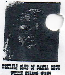
WILLIE NELSON CLUB OF SANTA CRUZ WILLIE NELSON WIFE