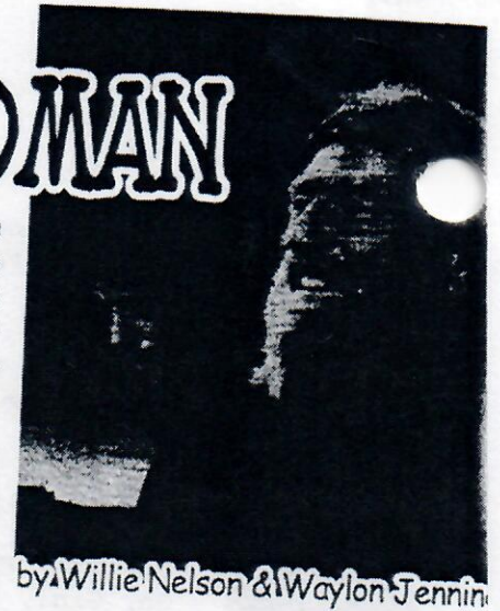
by Willie Nelson & Waylon Jennings

Willie Nelson once recalled "Waylon Jennings once asked me for some friendly advice on moving to Nashville, giving up a good job with a higher-than-average income to dig for some gold on Nashville's 16th Avenue concrete. Naturally I told him to stay where he was, and fortunately, he didn't listen."