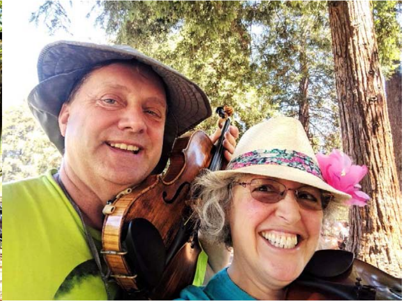
Handsome musicians' selfie