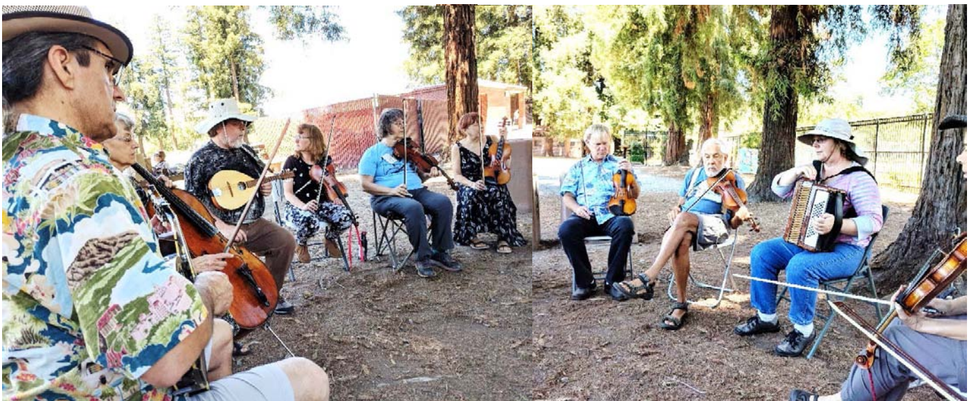
Dazzling Ol'time circle deep reflection: what shall they play next?